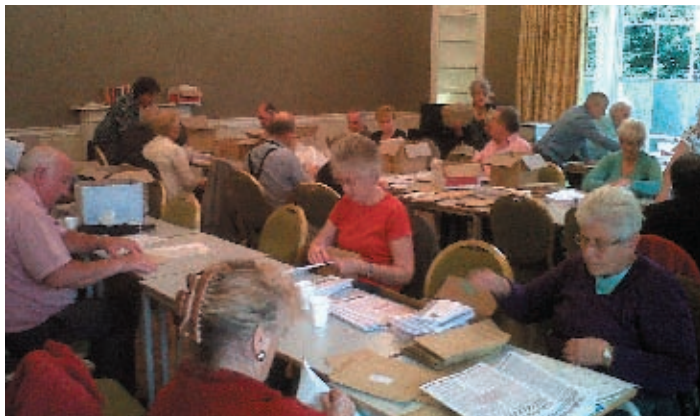
Forum volunteers stuffing our newsletters

Whether you are already one of our band of volunteers - or can offer us time in the future, we ask you to contact the Forum office and tell us you'll be coming to the wine and cheese reception in the Civic Centre on Monday 28 May between 6 and 8 in the evening when we can answer questions and give you more details. Contact the office 020 8807 2076.