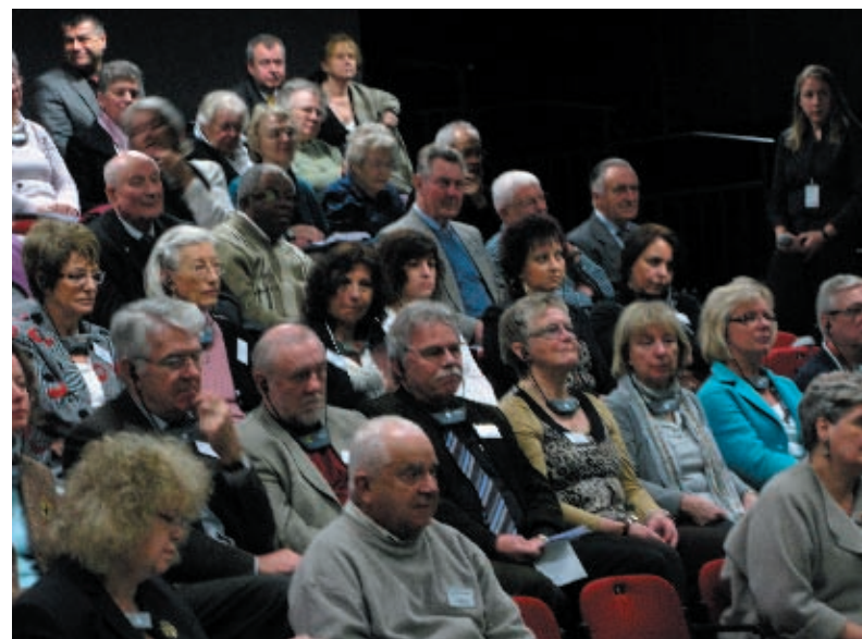
Final session at the Dugdale Centre