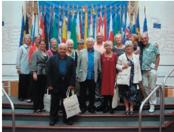
Forum's steering group at the Strasbourg European Parliament