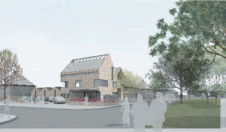
Artist's impression of the new Hospice

To reach out to a greater number of people, the North London Hospice is currently building a new day centre at Barrowell Green, off Green Lanes, which is due to open this summer. The main aim in building a second centre of excellence is to keep patients out of hospital and at home with their families in comfortable surroundings for as long as possible.