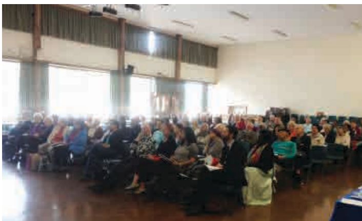
A packed audience in the main hall at Enfield County School for Girls at our conference on Prospects for Better Ageing

While highlighting the many issues confronting an ageing population, the overall message conveyed by both the speakers and the participants in the workshops was disappointment with the lack of foresight