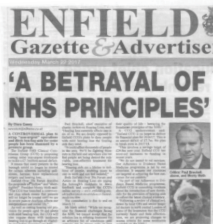
Forum campaign issue

It is as though one arm of the NHS which encourages patients to make greater use of pharmacists to reduce pressure on GPs and