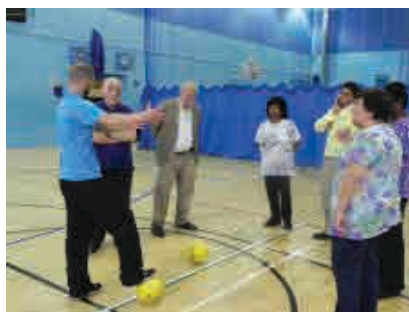
Walking football session at Edmonton Leisure Centre

In return for the concession price to the Over 50s Forum, we undertake to do all we can to promote the leisure centres, so as to improve their income