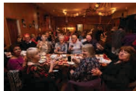
Enjoying the Forum's Christmas party