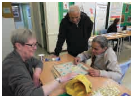
Scrabble session at the Winter Fair