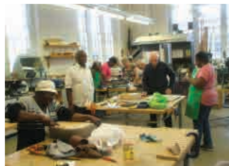
Forum handicraft group in action