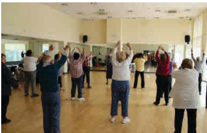
Falls day exercise class at Edmonton Leisure Centre

to improve facilities in the last year and expand the range of activities which now includes Tai Chi, walking football, walking basketball and ladies only aqua fit, chair yoga, beginners badminton sessions, lane swimming, and indoor bowls sessions. This is in addition to the well-established swim and gym facilities at the leisure centres.