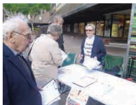
Forum getting shoppers at Palace Gardens to sign our petition on fairer funding for Enfield