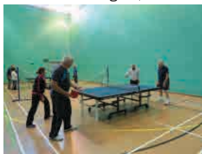
Table tennis at Southbury Leisure Centre

Fusion Lifestyles manages the leisure centres on behalf of Enfield Council and alone of the many centres they operate in various parts of the country, Enfield pioneered the Over 50s days offering a wide range of exercise and social activities. Demand for more classes is constantly outstripping the available space and time slots. What began as single day events at Southgate, Southbury, Edmonton and Albany leisure centres have now become two-day events at Southgate, Southbury and Edmonton.