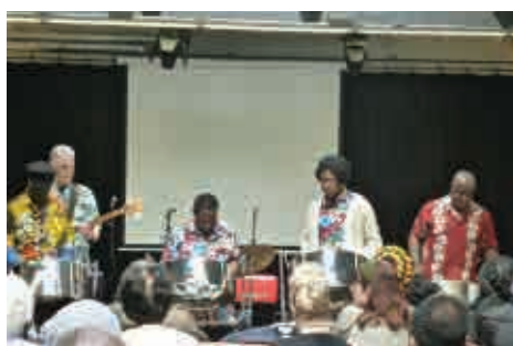
Steel band entertaining members at Millfield