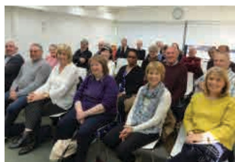
Forum group visiting Scotland Yard's Black Museum