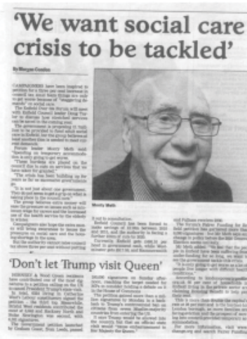
Forum 'fairer funding' campaign