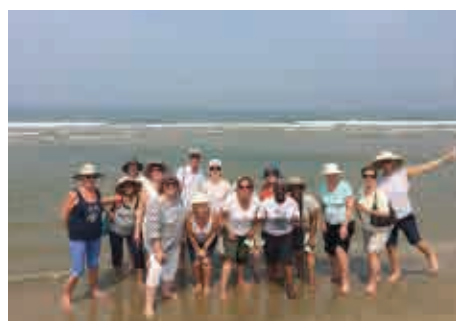
Forum Members holidaying in Vietnam