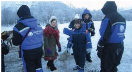
Forum members holidaying in Norway