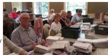
Volunteers gather at Millfield House to stuff 6,000 newsletters