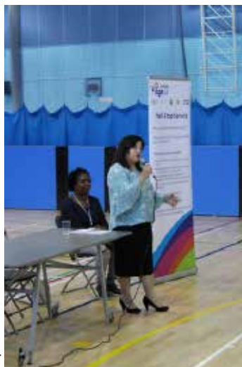
Talking about the Falls Stop Service at Edmonton Leisure Centre

Our relationship with the Fusion management continues to thrive and during the last year together we have appointed Ambassadors at each leisure centre