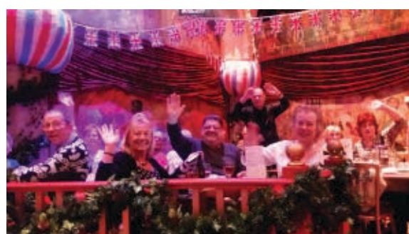
Members in party mood at Brick Lane Music Hall