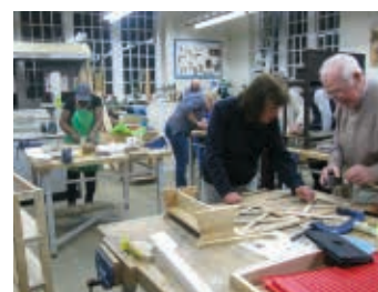
Forum handicraft group in action at Enfield County School for Girls