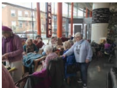
Knit & Natter Group at the Dugdale Centre