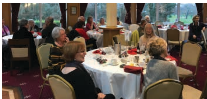
Forum second Christmas lunch on 8 January at Enfield Golf Club