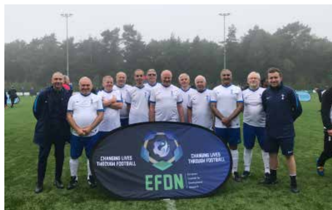
Over 50s walking football team

Time marches on from those days 14 years ago when we negotiated a £17 monthly pass to swim