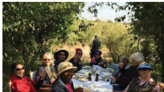
Forum members holidaying in Vietnam