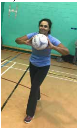
Over 50s netball at Southbury Leisure Centre

The Forum's continued liaison with Fusion Lifestyles must rank as one of our greatest achievements since the Forum was reformed in 2001, particularly when linked to the growth of the Over 50s special days at the leisure centres which started at Southbury in 2003-4 and are now also a feature at the Edmonton and Southgate centres.