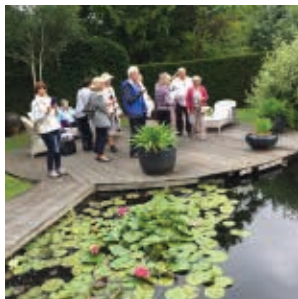
Visit to the Theobalds Garden