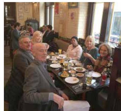
Lunch party at the Ceviche Peruvian Restaurant