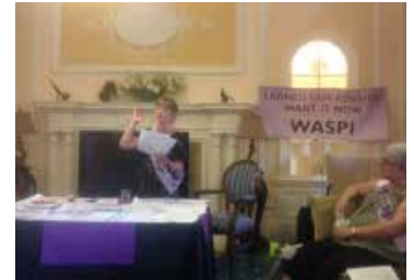
WASPI at the Beaumont Centre

In addition to these formal presentations a number of IT Drop-in sessions were held whereby members having problems with their computers, tablets, software and iphones were able to attend and in most cases get on the spot solutions and advice.