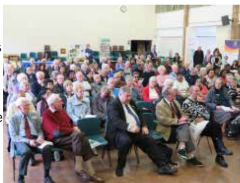
Health & Well-being was among the important issues discussed at the Forum's Winter Fair

Enfield also has a problem stemming from its shortage of GPs which is worse in some parts of the borough