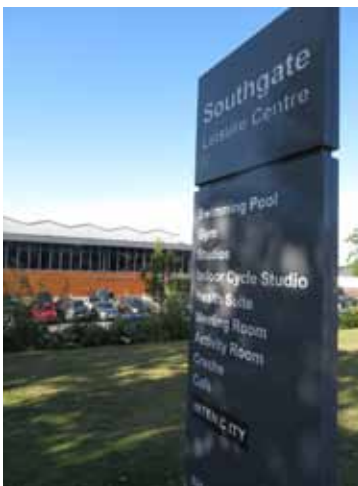
Forum members get discounts at all Fusion centres

The borough's leisure centres run by Fusion will no longer be accepting cash or cheques from Monday 2 March.