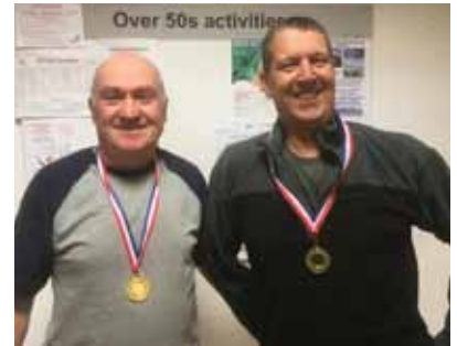
Winners of the badminton tournament which Fusion ran to help the Forum raise funds

https://enfieldover50sforum.org.uk/newsite/fusion/