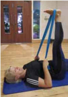
Fusion offers a wide range of classes

Fancy going for a walk with some friendly people and having a chat and coffee afterwards? Well some Fusion Leisure Centres will be offering all this for free from March.