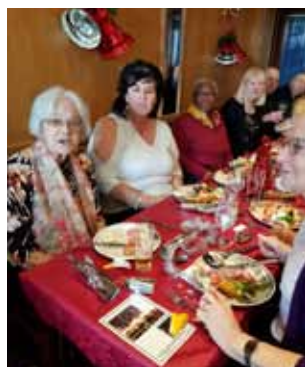
All the Xmas parties were a great success