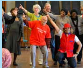
Getting involved in the entertainment