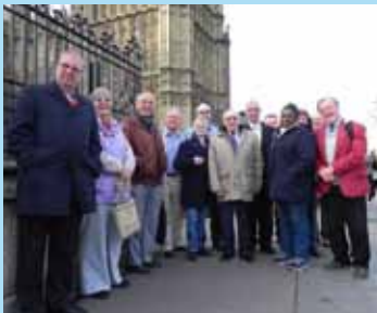
Campaigning at Parliament

We believe this is still excellent value and that most of you understand that an extra pound or two from all of our 5,000 or so members will make a significant contribution to our ability to help older people in Enfield.