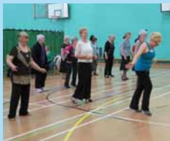
Line dancing at Southbury Leisure Centre

Of course, we also need donations, sponsorship and funding from other sources to continue our work and we apply for grants where we can. Our Social Events Team makes contributions from their activities and others such as Knit & Natter and the Southbury Fun