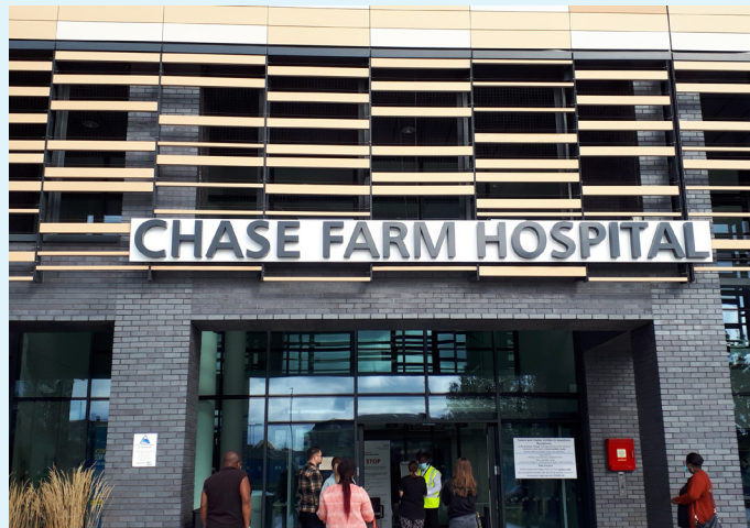
The Older Persons Assessment Unit was, in part, compensation for losing A&E at Chase Farm

The Forum is asking the MPs for Southgate and Enfield North to throw their weight behind our push for restoration.