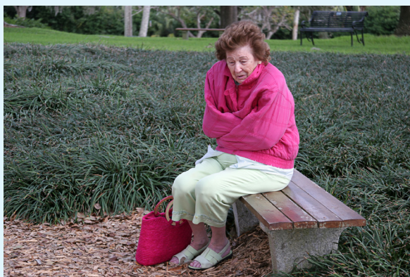
The lockdown and current restrictions are likely to have made the problem of loneliness even worse