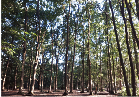
We need to protect existing forests and plant more trees to help reduce rising levels of CO2