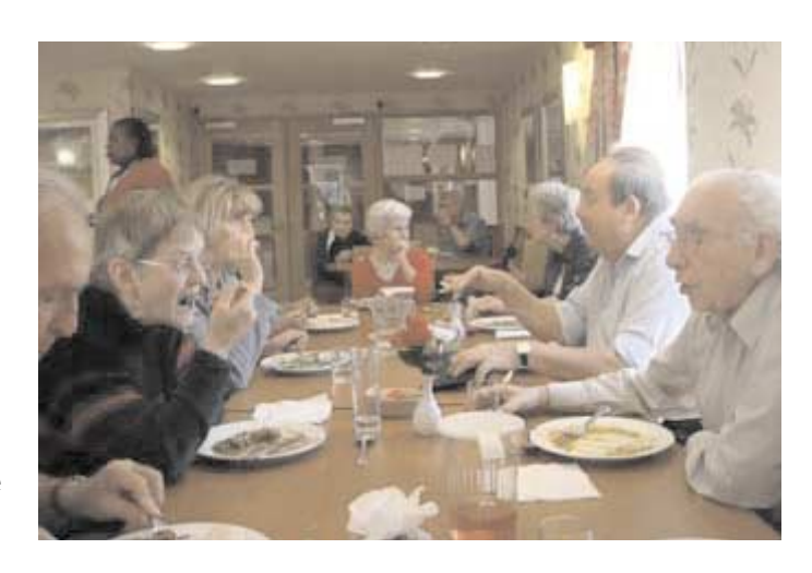
Committee members relaxing over lunch in Skinners Court's fine restaurant during their 'away day' to consider future directions for the Forum

Ex-Servicemen and Women and the 700-strong Unison retired members. We hope to strengthen this list in the coming year so that together we can claim that the Forum is the most representative voice of older people in the Borough and as such it merits consultation BEFORE key decisions are taken. 'Don't talk about us, without us' has to become the watchword for all decision-makers in the Borough.