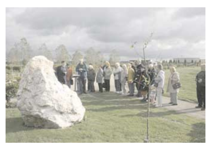
Members visiting the Arboretum at Lichfield. The Forum subsequently donated a pavior to commemorate those who fell during the two world wars