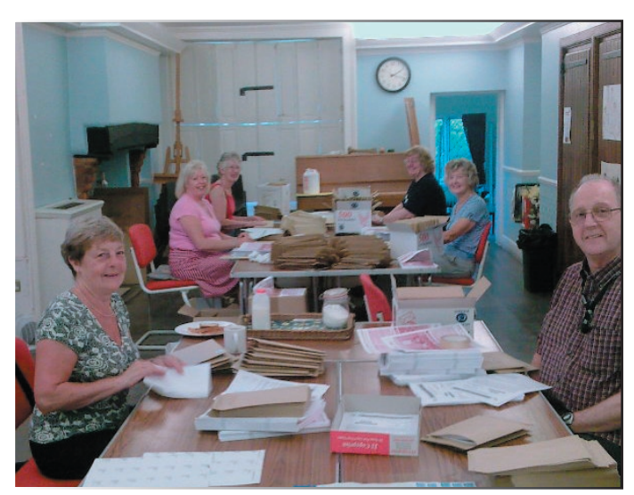
Newsletter stuffing team at Salisbury House.

The Forum with its strong nucleus of affiliated organisations with a combined membership running into many thousands including, for example, Heart Throbs, a cardiac special interest group with 400 members, the 1,000 strong Cypriot