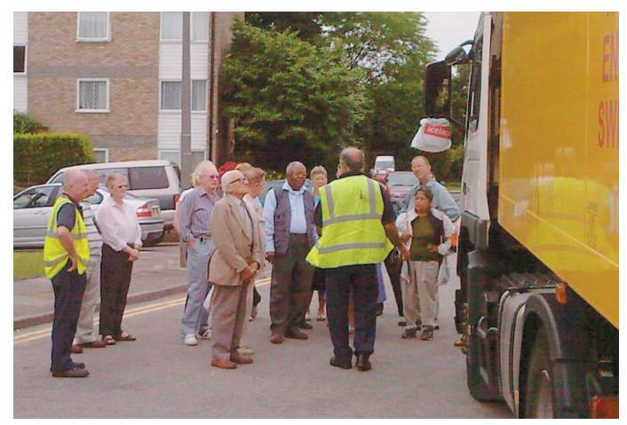
Skinners Court meeting on the dangers for older people of heavy goods vehicles.

we've had a council budget consultation meeting led by Clir Ertan Hurer , the Cabinet member for finance, a consultation meeting on the North London waste plan as well as speakers on road safety, tax help for older people and visitors to Bhutan and the North and South Poles gave us a slide show