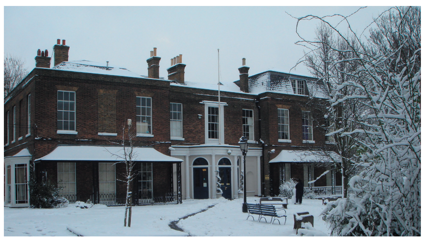
The Forum move to Millfield House in January 2009