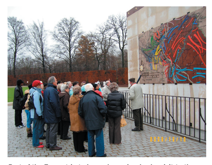
Part of the Forum trip to Luxembourg involved a visit to the 'Battle of the Bulge' memorial with a guide relating the events that took place at that crucial time during WWII.

Among the many and varied activities undertaken in the last year were a quiz evening with 120 participants which raised £607 for the Forum, trips using our Freedom Pass to the Wallace Collection, the state rooms at Buckingham Palace and the Queen's Art Gallery. We had day-long coach trips to Aldeburgh and Faversham, trips by coach to the Brick Lane music hall in Docklands and the RAF museum at Hendon, to the Ponsbourne Hotel for afternoon tea and a party of 45 which went to Luxembourg visiting the Christmas markets in the area was fully booked by June. And to mark the start of the Christmas festivities we had a most successful buffet lunch and entertainment at the Royal British Legion hall.