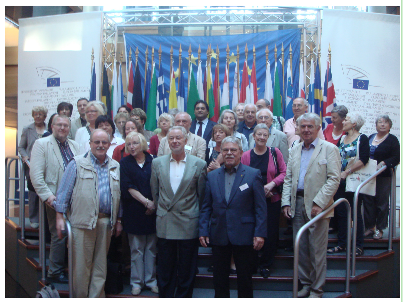
Forum's EU Project - International delegates at Strasbourg's European Parliament in September 2011

"The Forum publishes its 12 page newsletter 6 times a year and distributes 8000 copies of each issue. Over 3000 copies are posted to members and the balance is distributed to affiliate organisations supporting older people, libraries and GP surgeries and some supermarkets. It is Enfield's key publication for communicating with the over 50s."