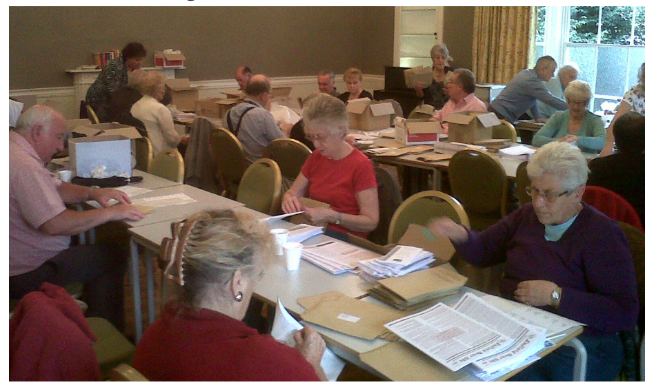
Volunteer 'stuffers' getting the Forum's newletters ready for posting