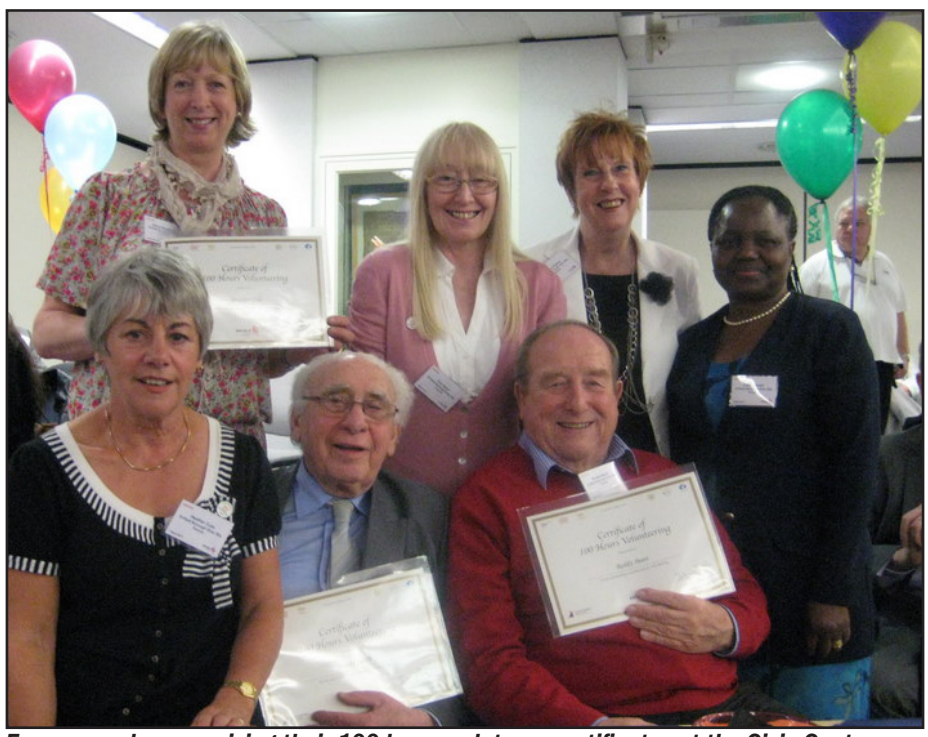
Forum members receiving their 100 hours voluteers certificates at the Civic Centre