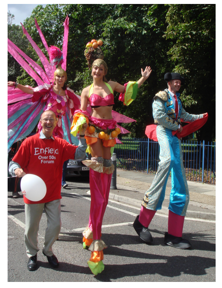
The Forum taking part in the Edmonton Carnival

The range of advisers has increased and now includes the Citizens Advice Bureau; the local authority covering council tax, housing benefit, pensions and attendance allowance; a local solicitor; a retired tax inspector; health and lifestyles trainer and a jobs adviser. Interestingly, people now drop-in to the centre to join the Forum, pay their subscriptions, have a coffee and a chat which demonstrates how popular such a centre would be for older people in the town centre if we had that facility available more often.