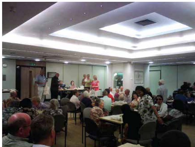
A Meeting of Forum Volunteers

The Newsletter of Enfield Borough Over 50s Forum has a circulation of 9000