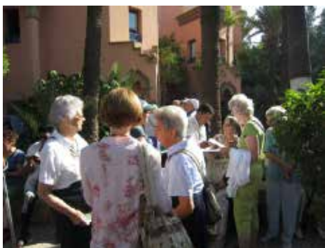
Forum members holidaying in Marrakesh

Apart from this, the social committee provides a funding stream to support the Forum. This year events and trips were in surplus to the tune of £1,429. Recommendations were made to the Executive for donations to be given to various local charities and others from these proceeds. New members and their ideas for future activities are always welcome, but it is expected that everyone on the committee is a worker, organising events or helping other members. The social committee is an outstandingly hard-working group, full of great ideas and enthusiasm and cannot praise them enough. The Forum should cherish them.