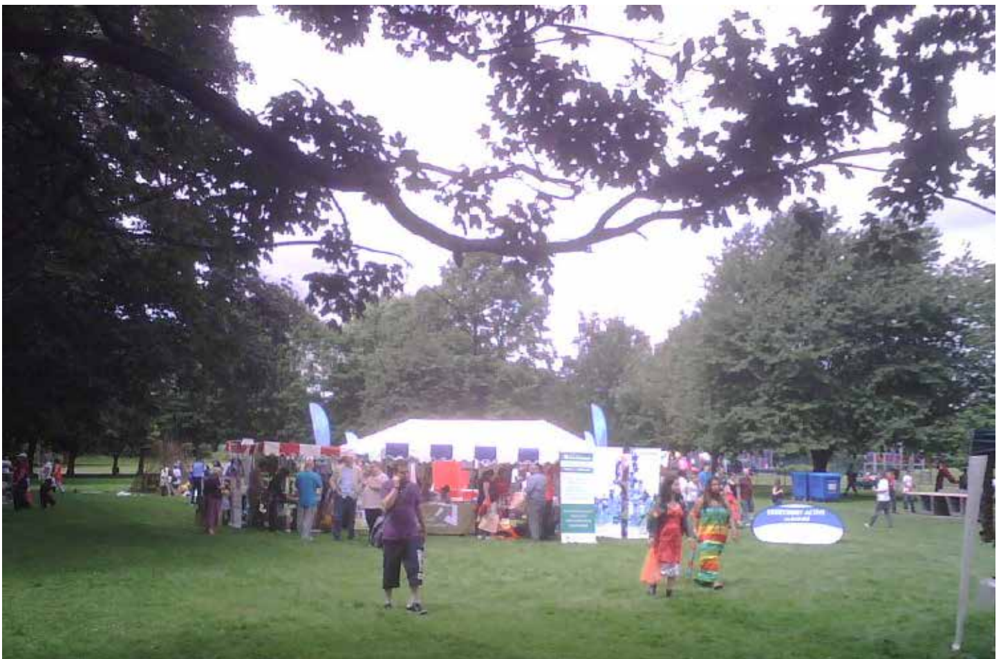
The Forum at Jubilee Park - Edmonton Carnival

For the coming year increased membership means that postage bills for each issue of the Newsletter are now at least £1,500. Currently we print 9,000 copies of the newsletter which besides being posted to our members is distributed to our affiliated organisations, GP surgeries and libraries across the Borough.