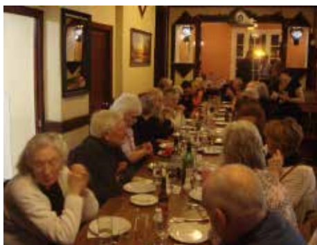
Dinner out at the Hertford Road Aksular Restaurant