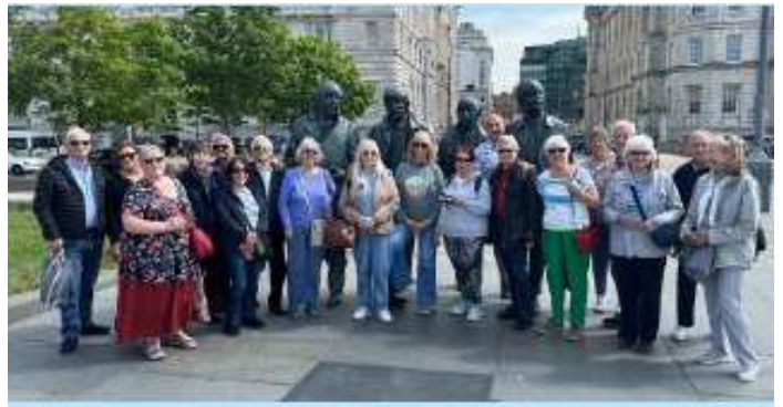
Liverpool city break

(XX) = Initials of the Social Committee member listed in the inside cover of this report