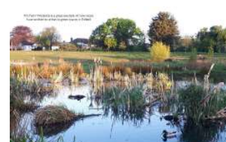
Left Firs Farm Wetland

The Forum has played an active part at each stage, responding to consultations, preparing Hearing Statements in response to the Inspector's questions and attending the hearings in public. There is more to come and we await the Inspector's final judgements and his