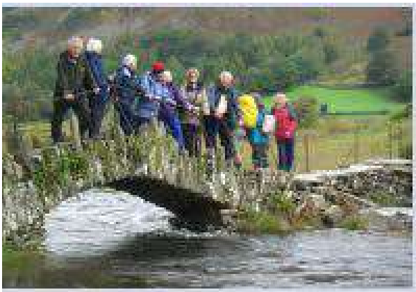
The Walkabouts Rambling Group

The Forum thanks our affiliates for their continuing support throughout the year. In return the Forum promotes their activities and programmes in our newsletters, eNews and website. Affiliates can also insert their leaflets in our mail-outs for a nominal cost.